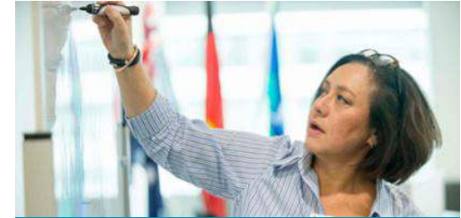
Specialist Advice on Healthcare Innovation