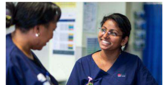
Continuous Capability Building

Collaboration. Innovation. Better Healthcare.