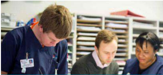
Service Redesign and Evaluation