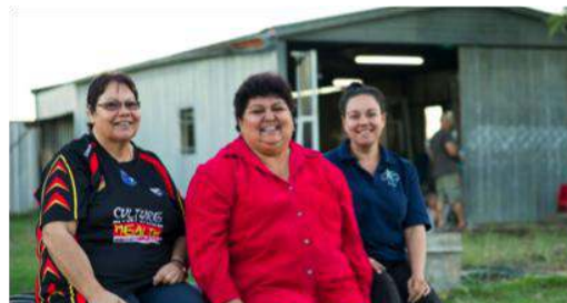
Initiatives including Guidelines & Models of Care